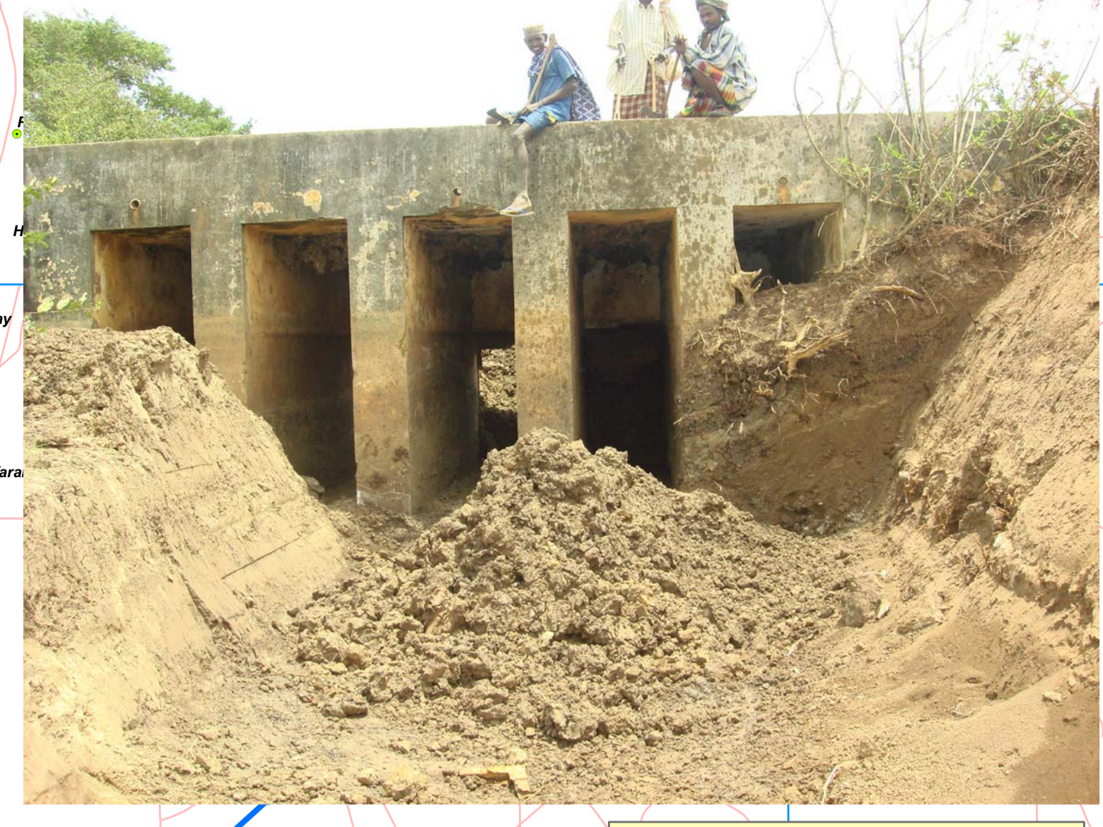
Fornari canal gates